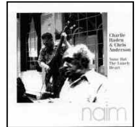
Charlie Haden & Chris Anderson None But The Lonely Hearth Naim 22 • CD $17.99 / LP $38.99